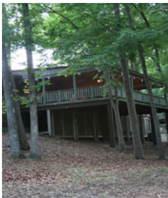
Beavers Bend Restaurant

Enjoy creamy lattes, flavored coffees, or cappuccinos while you surf the internet.